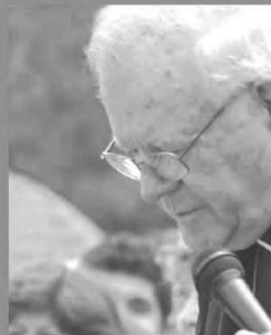
Bishop Moynihan praying for those involved with abortion.

Awards: Two - $1000 and One - $500 Scholarships