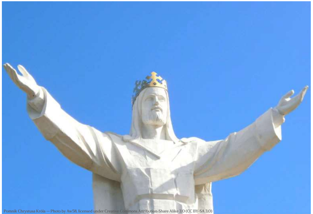
Pomnik Chrystusa Króla