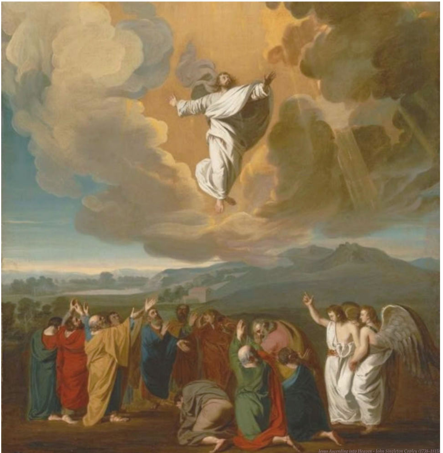
Jesus Ascending into Heaven - John Singleton Copley (1738-1815)

June 1, 2025 | The Ascension of the Lord