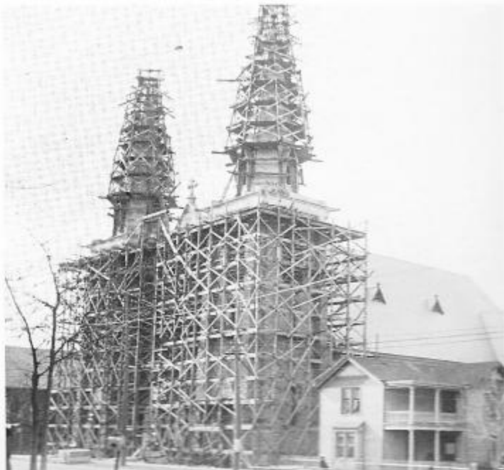
Above photo from 1910. Finishing completion of the Church steeples.

Thank you also to those who are using the monthly Raise the Roof envelope.